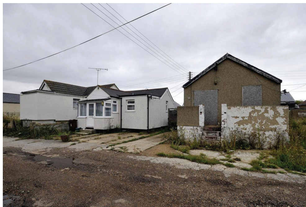
A disproportionate burden of cuts are in the most deprived areas with the greatest public health needs