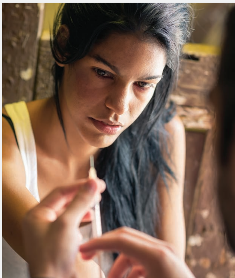
People being treated for crack cocaine problems increased by 18% since last year and 44% since the year before that

This new strategic direction gives us some challenging system objectives, including 'securing collective accountability' and 'reducing the number of organisations'.