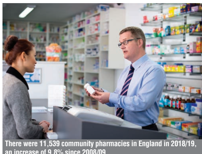
There were 11,539 community pharmacies in England in 2018/19, an increase of 9.8% since 2008/09

During 2018/19, 38 community pharmacies opened and 103 pharmacies closed. On average, the number of items dispensed by each community pharmacy in 2018/19 was 87,212,