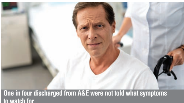
One in four discharged from A&E were not told what symptoms to watch for

Good communication is seen as crucial for patients, particularly in an emergency, and there were small improvements in the proportion of 'Type 1' attendees