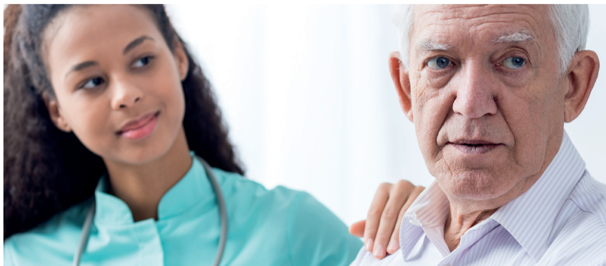
Councils are making big cuts to care for the elderly according to a study