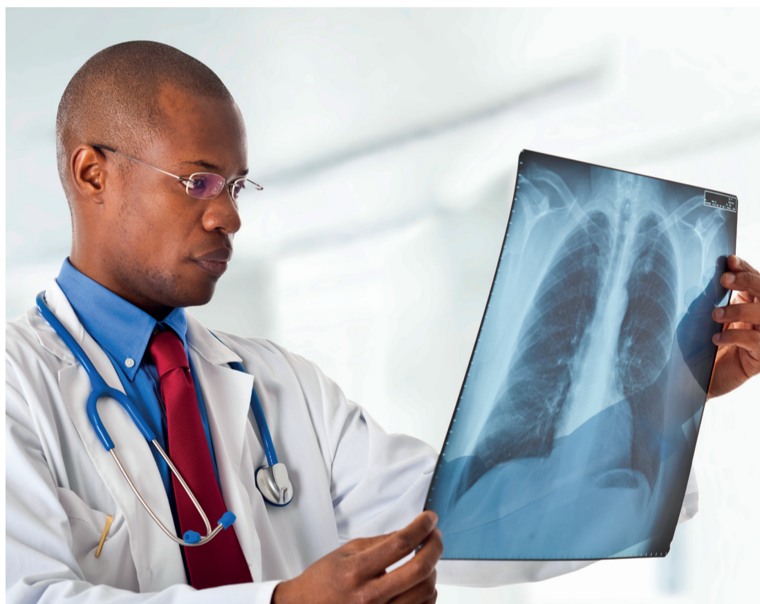
BME NHS staff are more than 50% likely to be disciplined than their white counterparts