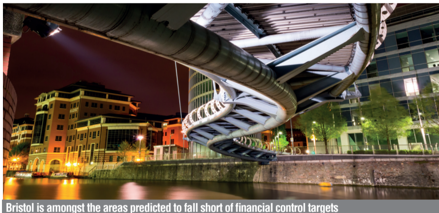
Bristol is amongst the areas predicted to fall short of financial control targets

NHS England is drawing up a list of areas with health economies that must make 'difficult choices' to cut back so-called 'unaffordable' services, according to reports.