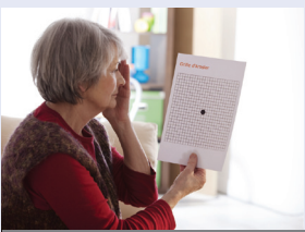
Those born after 1945 are less likely to suffer AMD

■ Baby boomers are 60% less likely to suffer from the leading cause of blindness than their parents, the first study of its kind suggests. Healthier living, cleaner air and water and fewer childhood illnesses could all be behind a 'rapid and dramatic decline' in rates of age-related macular degeneration (AMD).