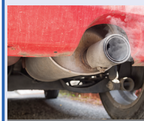
Diesel cars create pollution

■ The Government will be more than a decade late in meeting EU targets on air quality, says a report from the National Audit Office. The cost of the health impact from air pollution, including fine particulate matter and nitrogen oxides, is estimated at £20bn. Nearly 30,000 deaths were thought to be caused in 2008 by fine particulate matter pollution, some of it caused by diesel cars, according to the report. About 13% of fine particulate matter pollution is thought to come from diesel engines, in spite of improving air quality overall. The report also revealed that emissions of nitrogen oxides and fine particulate matter fell by roughly 70% between 1970 and 2015.