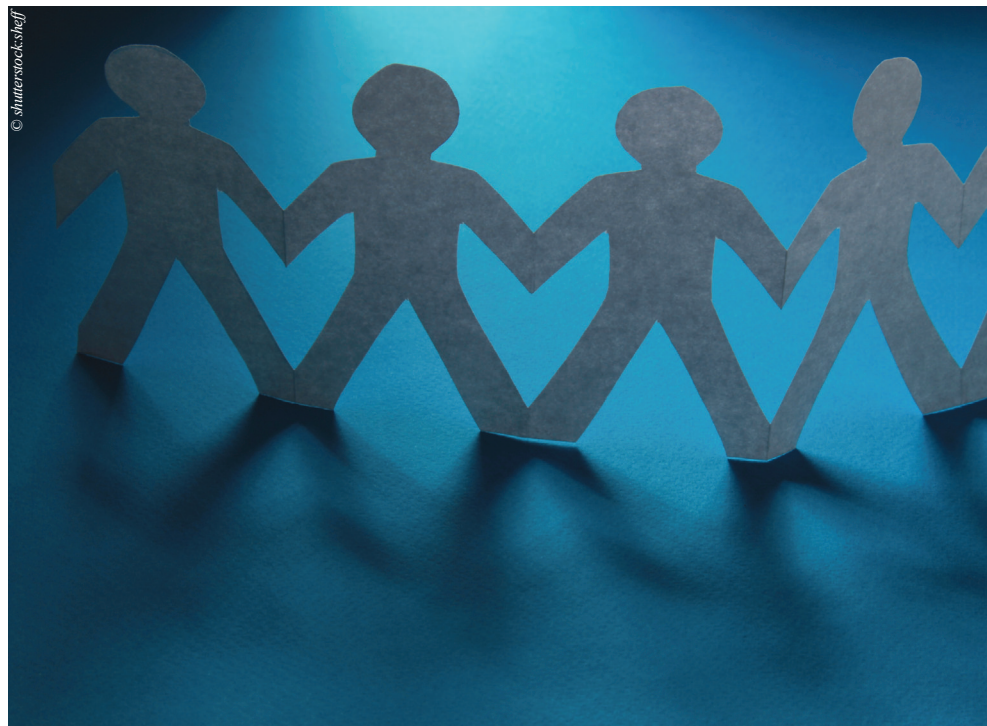
Research scientists have warned of a correlation between cuts to social care services and mortality rates

They linked this to an annual decrease in spending on adult social care by 1.2% between 2010 and 2014.