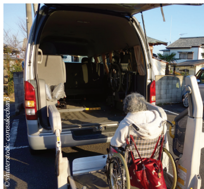
Elderly patients are spending less time in hospital owing to quicker transfers of care

'It is vital that government and NHS England work with councils to ensure we all make the best use of our scarce resources.'