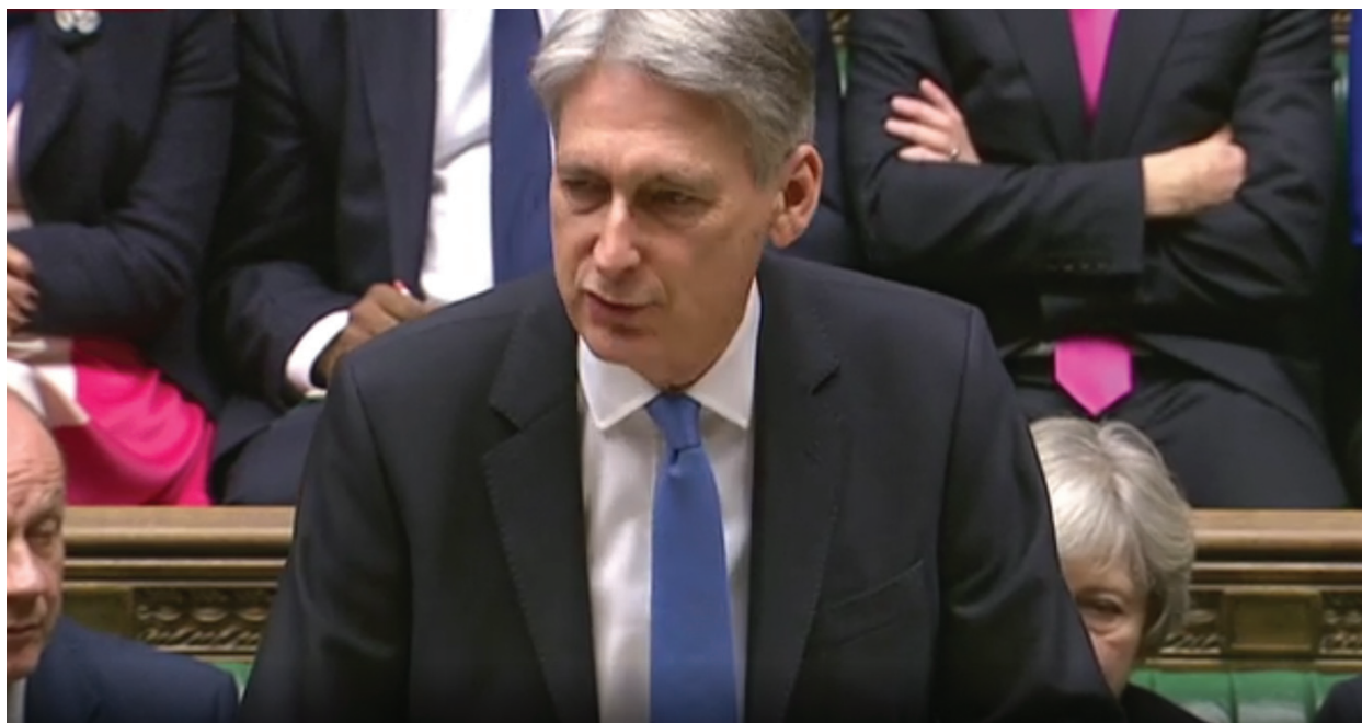
Chancellor Philip Hammond pledged an extra £2.8bn over the next three years including £350m for the coming winter, £1.6bn for 2018/19 and the rest in 2019/20, funding for extra pay for nurses and £10bn capital spend over this Parliament