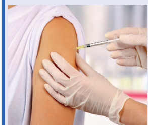
The UK has seen an increase in uptake of flu vaccinations

■ Community pharmacists administered almost a million flu vaccinations to adults at risk in England last winter through the NHS' national scheme – up 60% from the previous year, official figures have shown. A total of 950,765 vaccines were provided by 8,451 community pharmacies in 2016-17, according to figures published by NHS Digital. Although there was no major flu outbreak last winter, a spokesman said that the prevention campaign was a vital part of the NHS' strategy for keeping elderly and vulnerable patients out of hospital at the most critical time of the year for the NHS and to allow elderly people to be cared for at home.