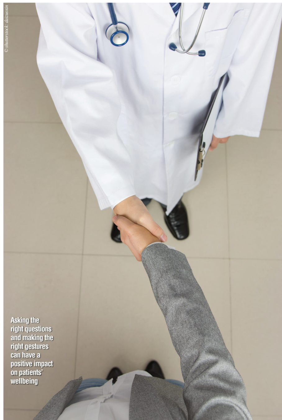
Asking the right questions and making the right gestures can have a positive impact on patients' wellbeing