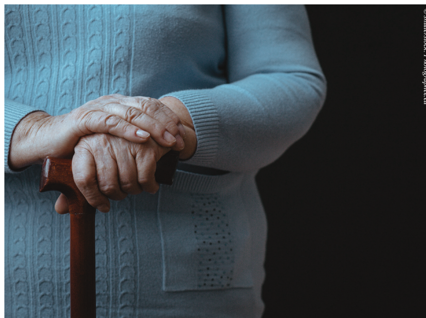
Increased longevity and staffing costs are being blamed for the rise in care-home place prices

This rise has also outpaced the growth in