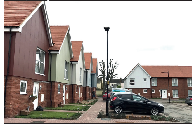
Hinguar School, Southend