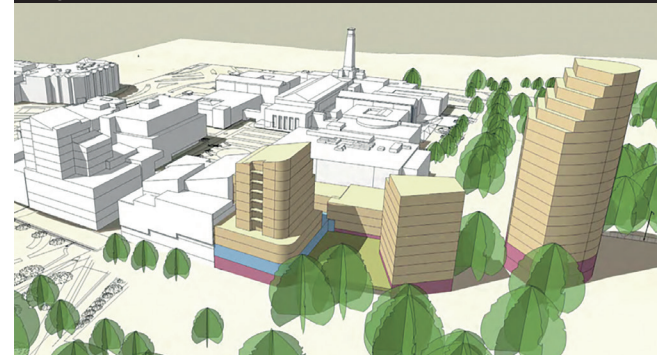
Above Barr, Southampton