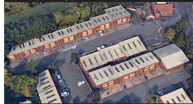
Lye Business Centre, Dudley