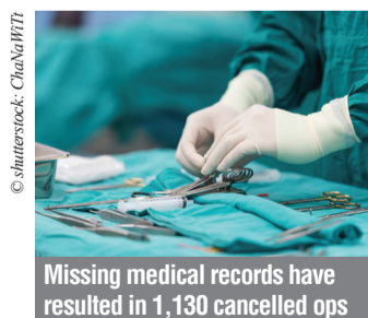
Missing medical records have resulted in 1,130 cancelled ops

Around 1,130 procedures were cancelled due to missing records. More than 21,840 medical files have been recorded as temporarily missing or lost, according to data released under a Freedom of Information (FoI) request. The Liberal Democrats said it was ‘deplorable’ and called for government action.