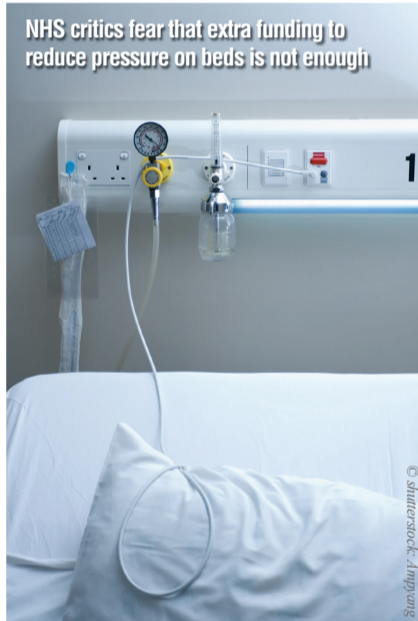
NHS critics fear that extra funding to reduce pressure on beds is not enough

immediately start discussions with their local authority counterparts on how the extra money will be spent.