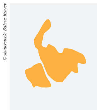
Several Merseyside CCGs are planning to merge their organisations in 2018

The news follows confirmation of the merger of three CCGs in Manchester. CCGs nationally are having to review their costs in the light of tighter spending on hospital services, and some believe that merging commissioning activities may help to do this, although no evidence to this effect has yet emerged.