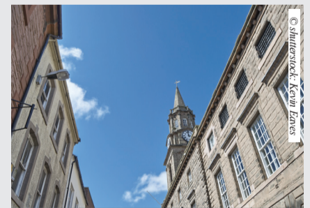
Northumberland is one of several councils under fire for social care failings

the best country in the world to grow old, making sure everyone diagnosed with dementia gets a personalised care plan, giving local authorities access to £7.6bn of dedicated funding for adult social care over the course of this Parliament.'