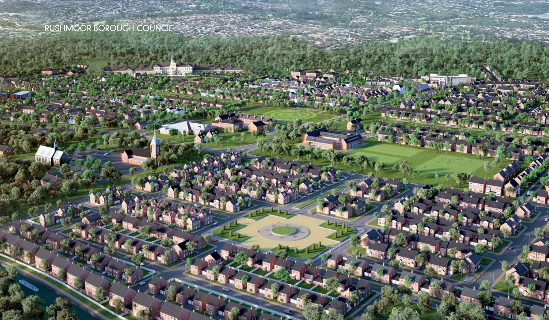
An artist's impression of the Wellesley development in Aldershot